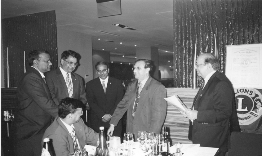
Seen above in the picture are Lion President together with fellow Lions of London Kensington & Chelsea welcoming the newly inducted members