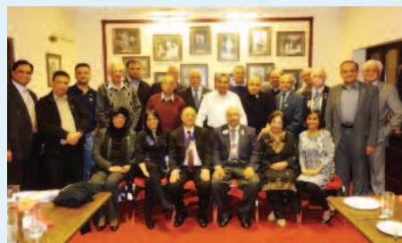
LC Greenford Willow Trees Business Meeting 6 Jan