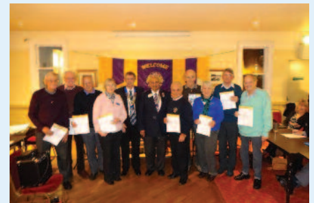
LC of Bedford Business meeting 13 Jan