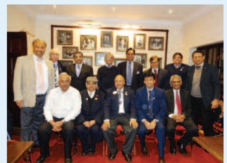
LC of London Golders Green Business meeting 14 Jan