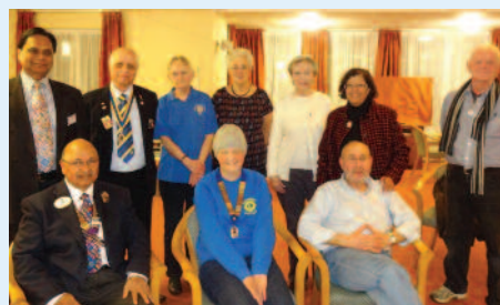
LC of Northwood Business Meeting 7 Jan