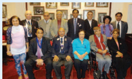
LC of Belmont social 17 Dec