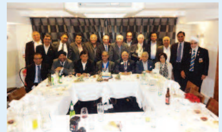
LC of Moor Park Business meeting 15 Jan