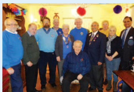
LC Letchworth Garden City & Baldock business meeting 12 Jan