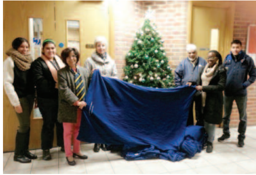
Stanborough Church In Watford before the soup run to Holborn

We also managed to acquire, through our PDG Lion Surjit Bhalla approximately 200 rejected cabin crew blankets from British Airways. He very kindly also helped