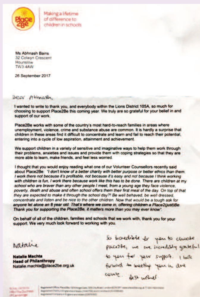
Letter from the charity Place2Be, part of the 'Heads Together'