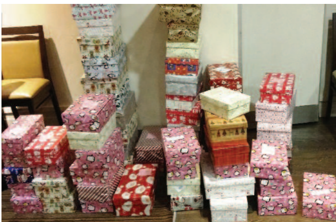
Boxes lined up for Romania