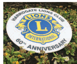
In Harrogate Town Centre