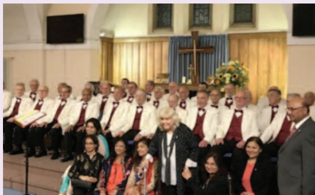
The Lions Kenton and Stanmore Fund event for the Aspire centre and spinal injury Unit.

From the 27th September to 1st October, I attended Europa Convention in Montreux. It was also a celebration of 30 years of women joining the organisation.