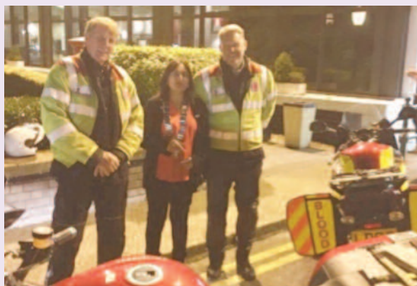
Surrey and South London Blood Runners.