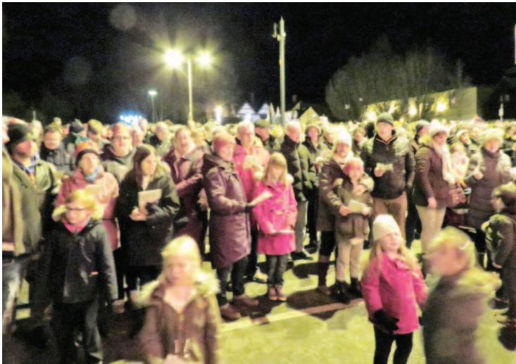
Carol singing arranged by Tring Lions