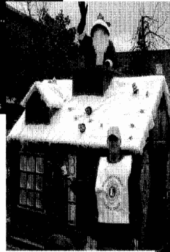
Santa listens very hard to all the children and makes their dreams come true, (with some help from Lions)