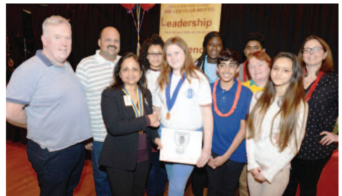
Leos receiving Award for Excellence