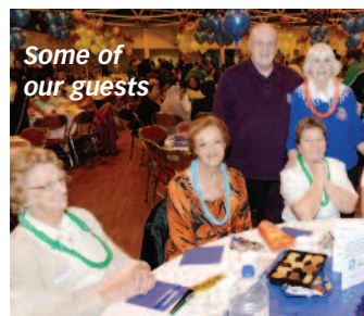
Some of our guests

would have been to be invited. For them and for so many others it is a chance to have a break from their surroundings and let their hair down for one afternoon.