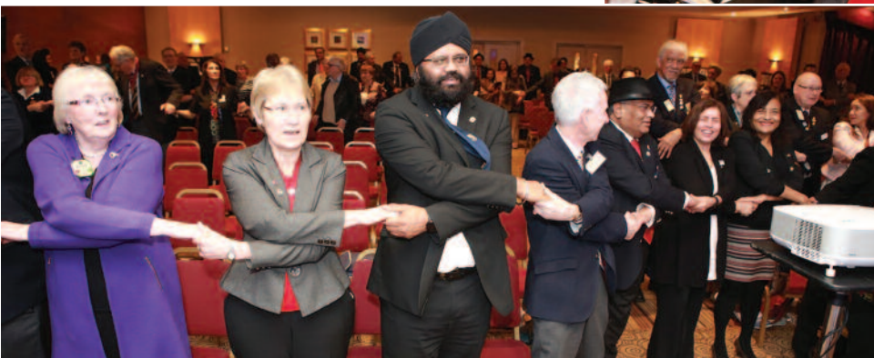
At the end of the day