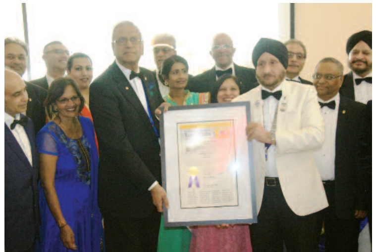
Charter presentation to Redbridge Centennial Club