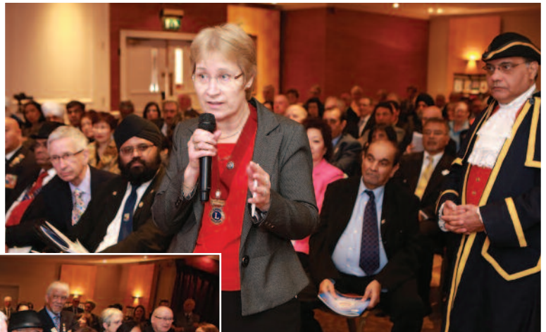
Questions from the delegates