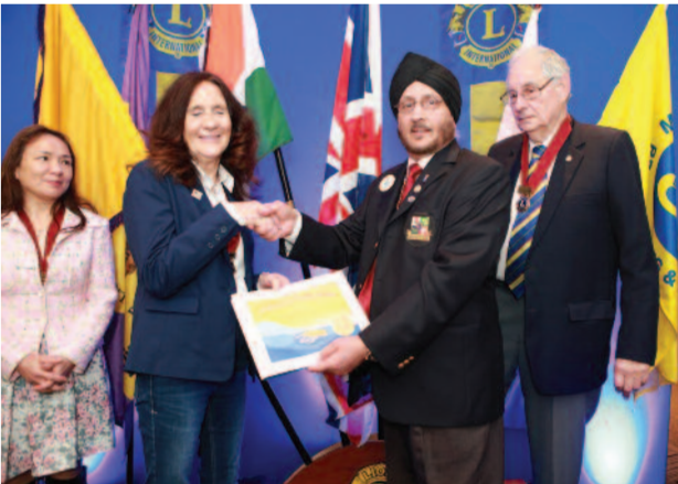
Recognition by the DG Brindar