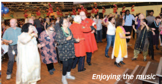
Enjoying the music

It was a joy to see so many happy and smiling faces, with many seniors saying they couldn't wait till next year's next year's celebration. I look back and think how pleased my parents