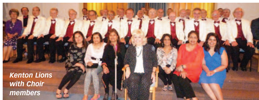
Kenton Lions with Choir members