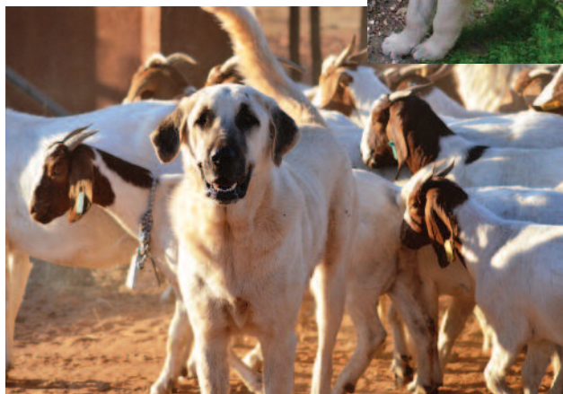
HOPE... the brave dog