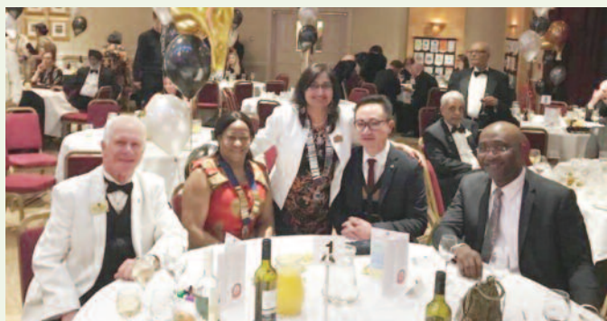
At the DG Ball

Then those attending the DG's dinner and dance went to get