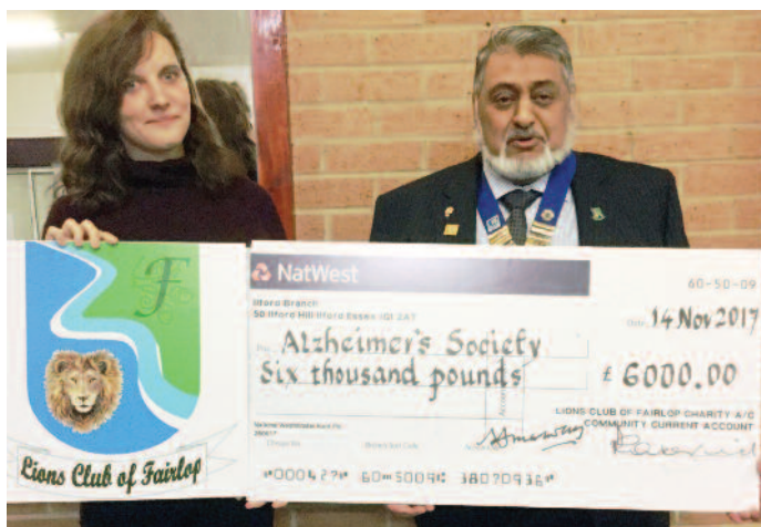
Fairlop donation for Alzeimers