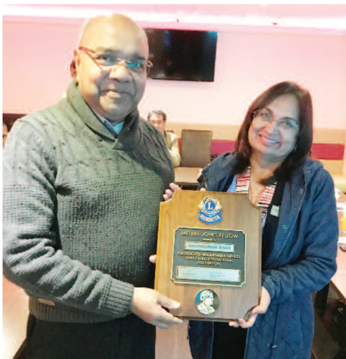
At LC of Hendon, the proud recipient of MJ Fellowship