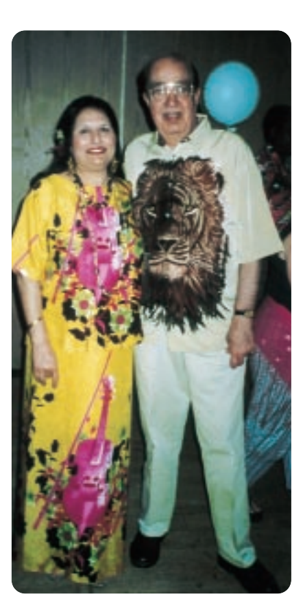
The DG & his lady in full "Lions Regalia"