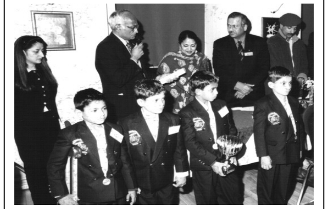
easy. It is painful and tiring; in fact it

Lion Ayn continued: "Running 26.2 mile is not