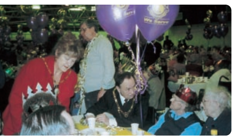
It was fun, colourful & full of cheers & goodwill. Another highly successful senior citizen's party