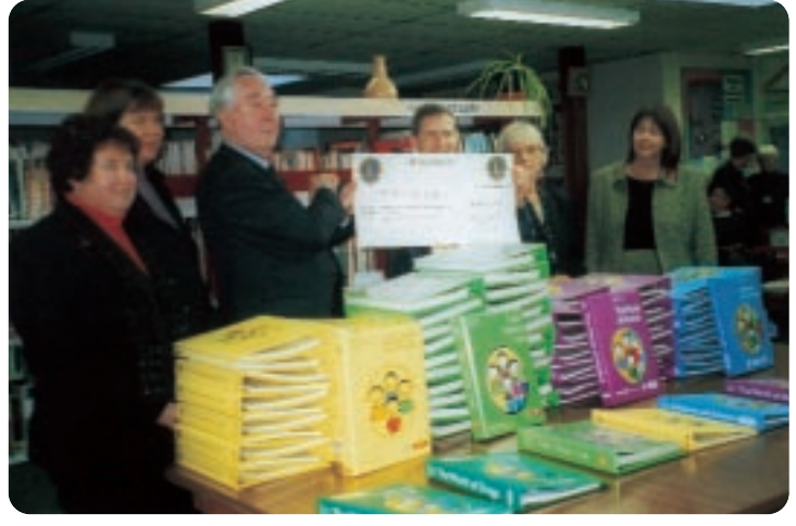
Abingdon Lions do their bit for "Skills"