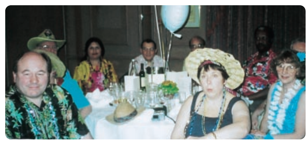
The wide eyed top table guests at Host Night are clearly awed by something