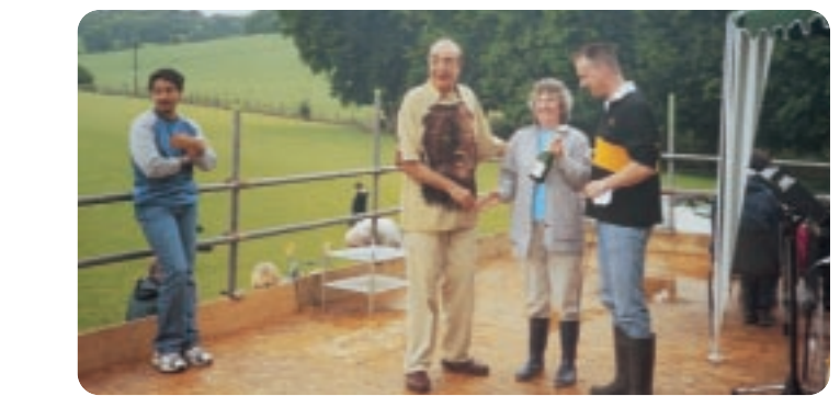
It was a Fun Day... But it rained! The DG presents a bottle of bubbly to warm the spirits...