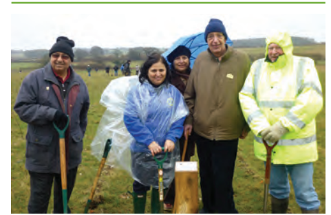
Tree Planting on a Spring (!!) day