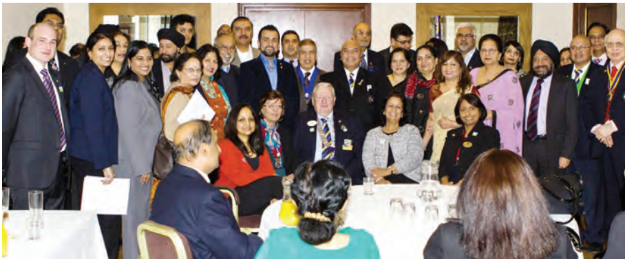
Members and guest at Park Royal formation