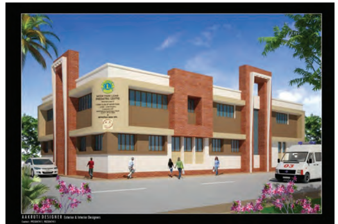
Artist's impression of how Moor Park Lions Hospital will look