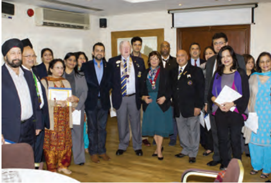
Lions Club of Park Royal formation