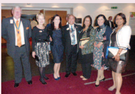
At the formation of Eaton Bray Club