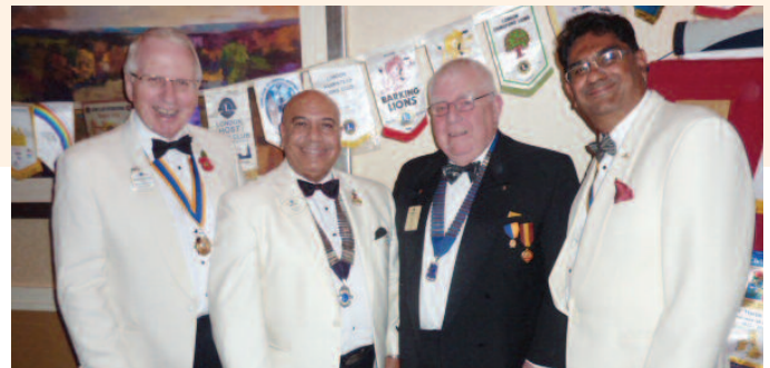
Charter celebration Bletchley Milton Keynes.