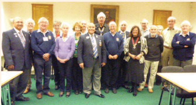
Official visit to Aylesbury Lions Club