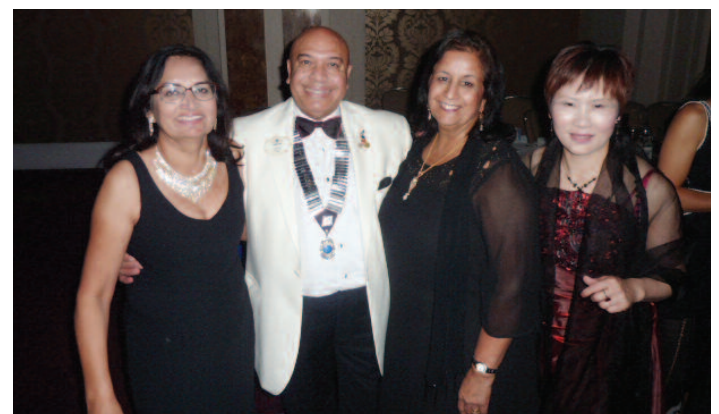
Charter celebration Chinatown, London.