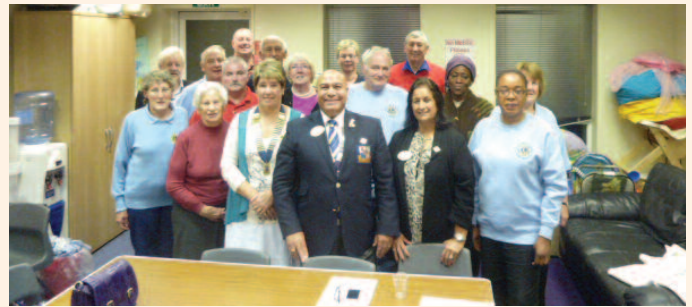
Carterton Lions Club Charter celebration.

The Council of Governors' meeting was held at Solihull on 25th-27th October 2013, where many issues were discussed to strengthen our Multiple Districts. I was delighted to attend Charter Celebrations of Biggleswade LC, London Chinatown LC, Carterton LC, Enfield LC, Luton LC, and Bletchley Milton Keynes LC. I