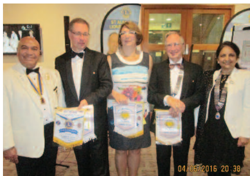
St Albans 50th Charter

St Albans celebrated their 50th Charter with great fun and fellowship. Nearly 35 members from twinned clubs from France and Germany were in attendance along with clubs from the Zone, friends and family.