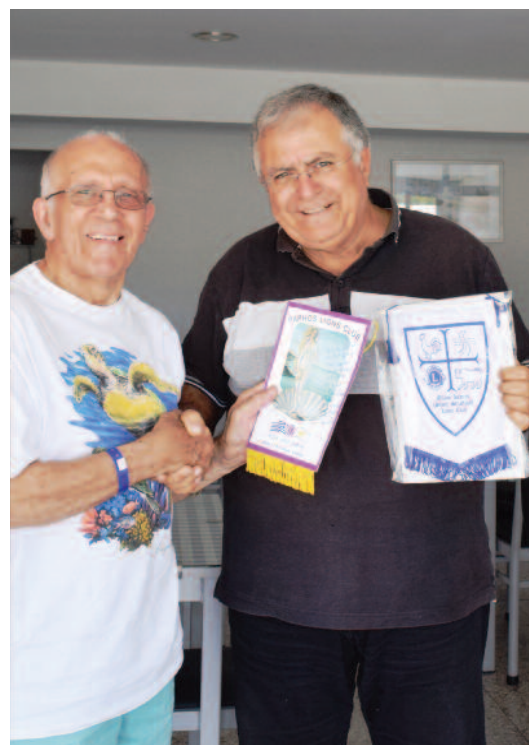
The Cyprus banner exchange