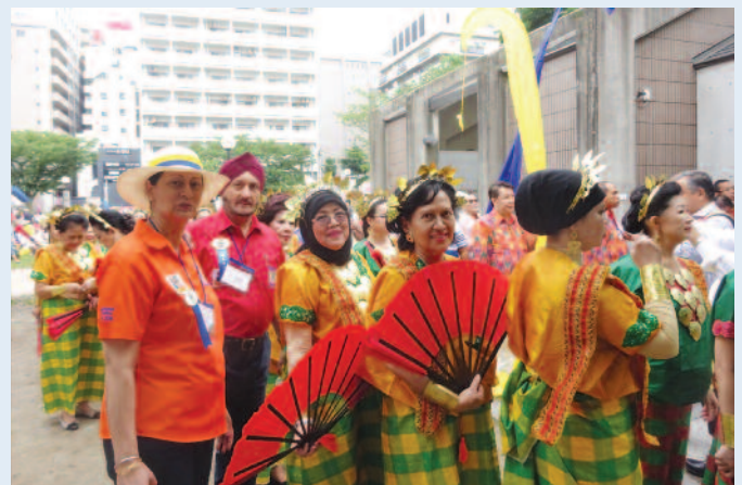
At the International Convention in Japan