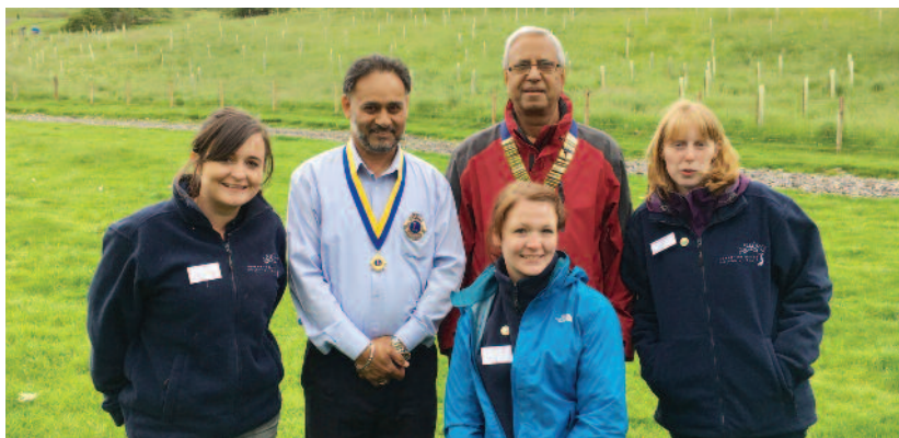
Trees for the environment