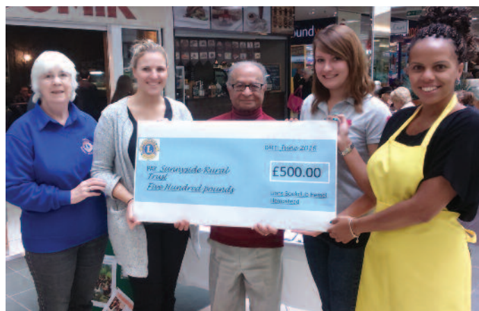
Hemel Hempstead donation