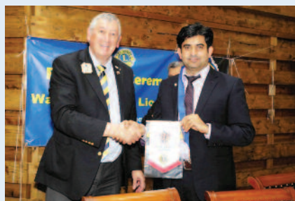
Baner presentation LC Waltham Forest