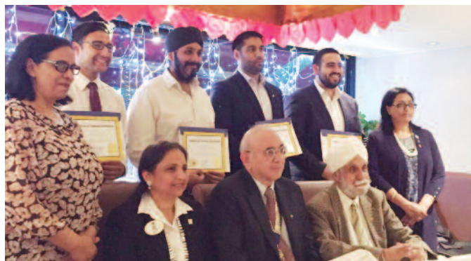
Young Lions of West Drayton Branch Club

We wish them the same success as their parent club!