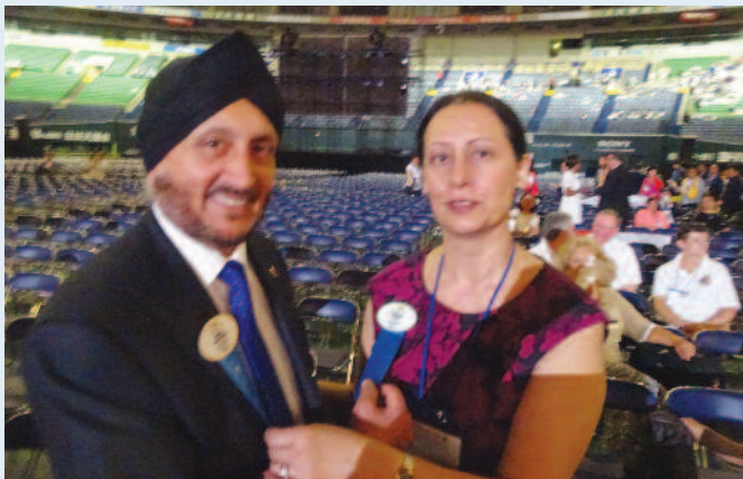
DG Ribbon removing

The following day our MD team joined the International parade with almost 30,000 Lions, with music and traditional dancing from many countries. The colourful national dresses, national flags and smiles from Lions from more than 200 countries. All with one thing in common that bonds all Lions together and that is to Serve those less fortunate than ourselves. It goes without saying that this parade epitomises who we are and surpasses all other parades.