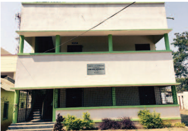
The Library and Science Block

With the tremendous support received during 2015-16, from Lions Club of Enfield, Empowerment through Education, (ETE), a UK based charity was able to build and equip a Library and Science Block, Computer and Digital Classroom and a Dining Block in Talakondapally Village – Government school, 60km from Hyderabad, India.