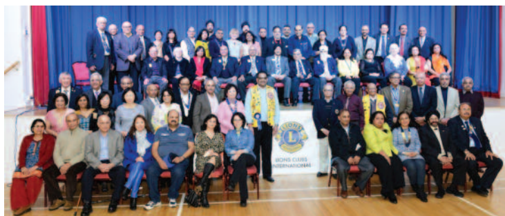
Lions gathered after the tree planting