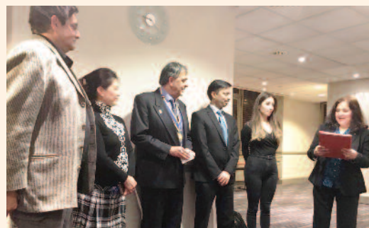
New Lions inducted at London Central